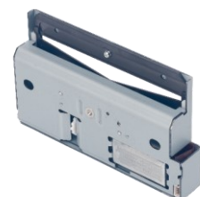
Cutter Unit (general / for liner-less)